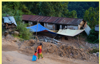
Building site: Old and damaged primary school

The Village Development Committee (VDC) and THE School Management Committee (SMC) have decided to build a Hostel for about 50 students of all three grade levels. The Hostel will be built on the former premises of the primary school.